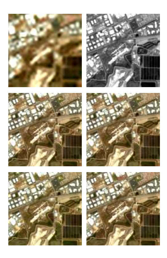
Fig. 1. Fusion results. (Top left) HS image. (Top right) MS image. (Middle left) MAP estimator [9]. (Middle right) Wavelet MAP estimator [12]. (Bottom left) Proposed DL-based fusion method. (Bottom right) Reference image.

This section compares the proposed method with two other state-of-the-art algorithms studied in [9] and [12] for the fusion of HS and MS images. To evaluate the quality of the proposed fusion strategy, different image quality measures are investigated. Referring to [12], we propose to use RMSE (root mean square error), SAM (spectral angle mapper), UIQI (universal image quality index) and DD (degree of distortion) as quantitative measures. The definition of these indexes can be found in [1, 27]. Larger UIQI and smaller RMSE, SAM and DD indicate better fusion results. Fig. 1 shows that the proposed method offers competitive results comparing with the other two methods. Quantitative results are reported in Table 1 which shows the RMSE, UIQI, SAM and DD for all methods. It can be seen that the proposed method always provides the best results for the considered quality measures (at the price of a higher computational complexity).